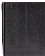
● Soho Night

This tile is sophisticated and features a centre shadow line that imitates a traditional shingle roof. This creates a minimalist, stylish and exclusive look. Comes standard with C-LOC™ Colour Lock Technology, so your roof looks better for longer.