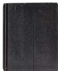
● Soho Night

'Sophisticated' best describes the look of Madison. This roof tile features a centre shadow line that imitates a traditional shingle roof, creating aesthetic that is unashamedly minimalist, stylish and exclusive. Comes standard with C-LOC™ Colour Lock Technology, so your roof will look better for longer.