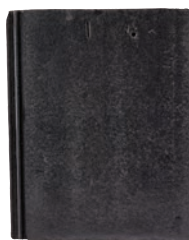
● Soho Night

With its 'hewn stone' finish, Cambridge is the ideal choice to replicate a slate look. Its unique appearance complements both contemporary and classically styled architecture, whilst conveying a level of sophistication that will be the envy of your neighbours.